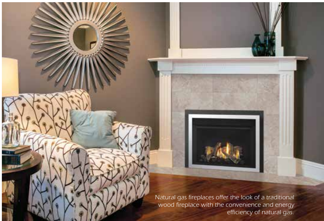
Natural gas fireplaces offer the look of a traditional wood fireplace with the convenience and energy efficiency of natural gas.