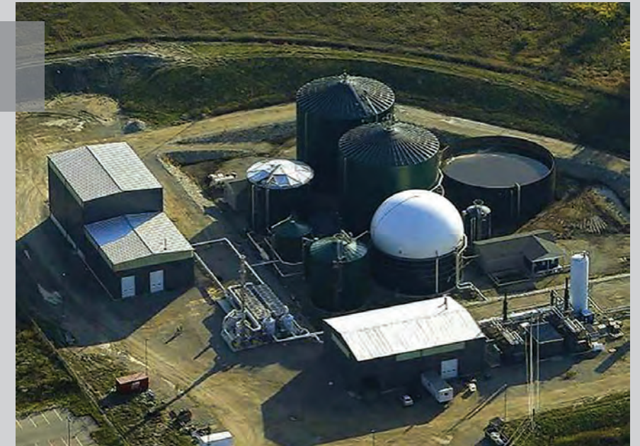
This photo shows an anaerobic digester operation.

tans, and much more. That section also asks for other constituents like arsenic, vinyl chloride, toluene, antimony, copper, and lead, as well as their biogas source. These are typically from dairy or publicly operated treatment works (POTW) landfills.