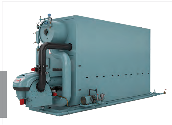
The model FLX flexible watertube boiler for either steam or hot water is designed to minimize thermal stress and provide quick response in a compact unit. There is also a field-erectable option.

MacMaster said that the efficiency of Miura boilers average in the mid-80% range. "When coupled with a condensing economizer, our overall efficiency increases to more than 90%," he said. "This is because the small heating surface reduces radiant heat losses and rapid response to fluctuating steam demand reduces energy losses."