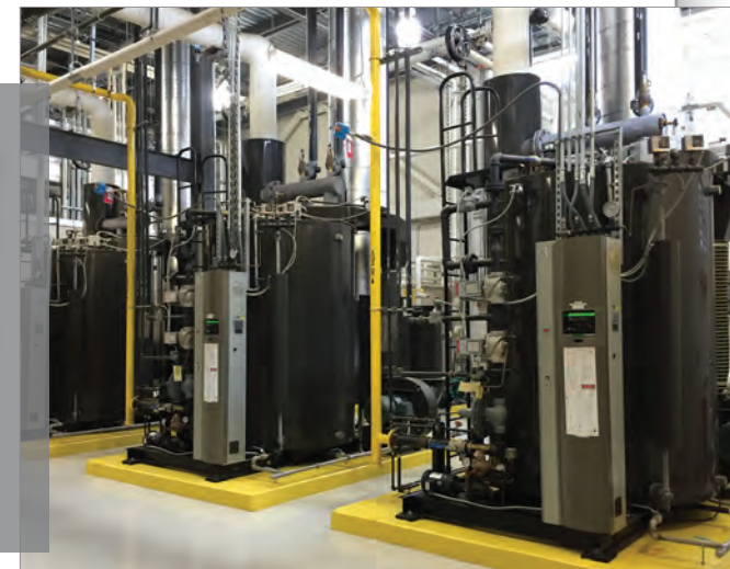
These model EX dual fuel boilers, installed at a health care facility, allow for a small footprint. The largest (EX300) holds a little more than 100 gallons of water in many small tubes, which are surrounded by a triple layer outer shell and casing.

a second 600 hp boiler to be in standby mode just in case the main unit goes offline. With a modular approach, the N+1 requirement could be met by installing just 800 hp, or four 200 hp boilers instead of 1,200 hp with two 600 hp boilers." GT