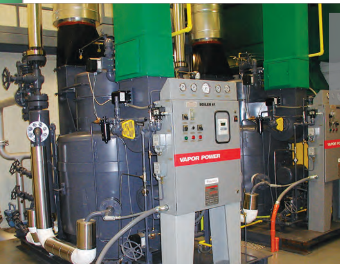
A safety valve manufacturer in Farmingdale, N.Y. uses two 200 bhp Modulatics once through watertube boilers because of their unique combination of low flow and high pressure, which work well for safety valve testing.

A. Kuhlman, Midwest regional sales at Vapor Power International, 90% of the water is converted into steam in the coils. Dry steam is then produced in the steam separator. The water remaining is removed by a steam trap.