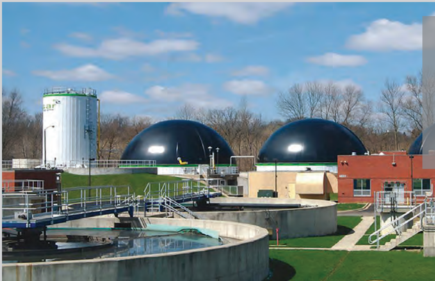
This photo shows a wastewater treatment plant and the anaerobic digesters that exist onsite to process the treatment plant's sludge and turn it into a usable product—biogas—which can be cleaned to become RNG.