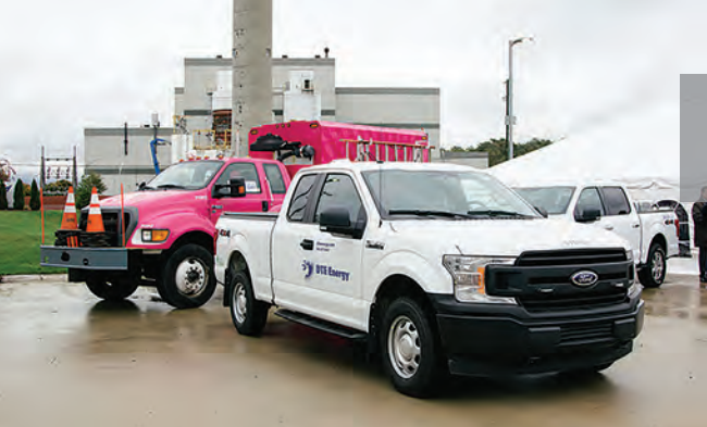
The photo shows a DTE Energy Gas CNG distribution work truck and a CNG supervisor vehicle.