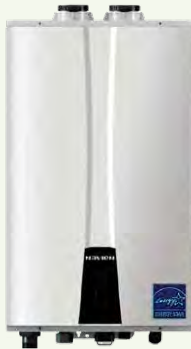
Because tankless systems deliver hot water only when needed, they save both energy and money.

Tankless systems certified by the Environmental Protection Agency's ENERGY STAR® program are often eligible for utility rebates to help offset the initial purchase price. ■