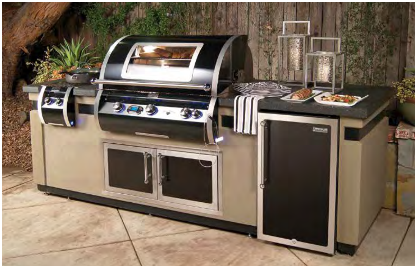
Grills – both simple and elaborate – are a center point of outdoor kitchens, bringing the reliability and efficiency of natural gas to help create the perfect backyard oasis.

grills, pizza ovens and firepits. They may want to add a heating element to maximize its functionality. A homeowner can probably develop a great plan for any budget.”