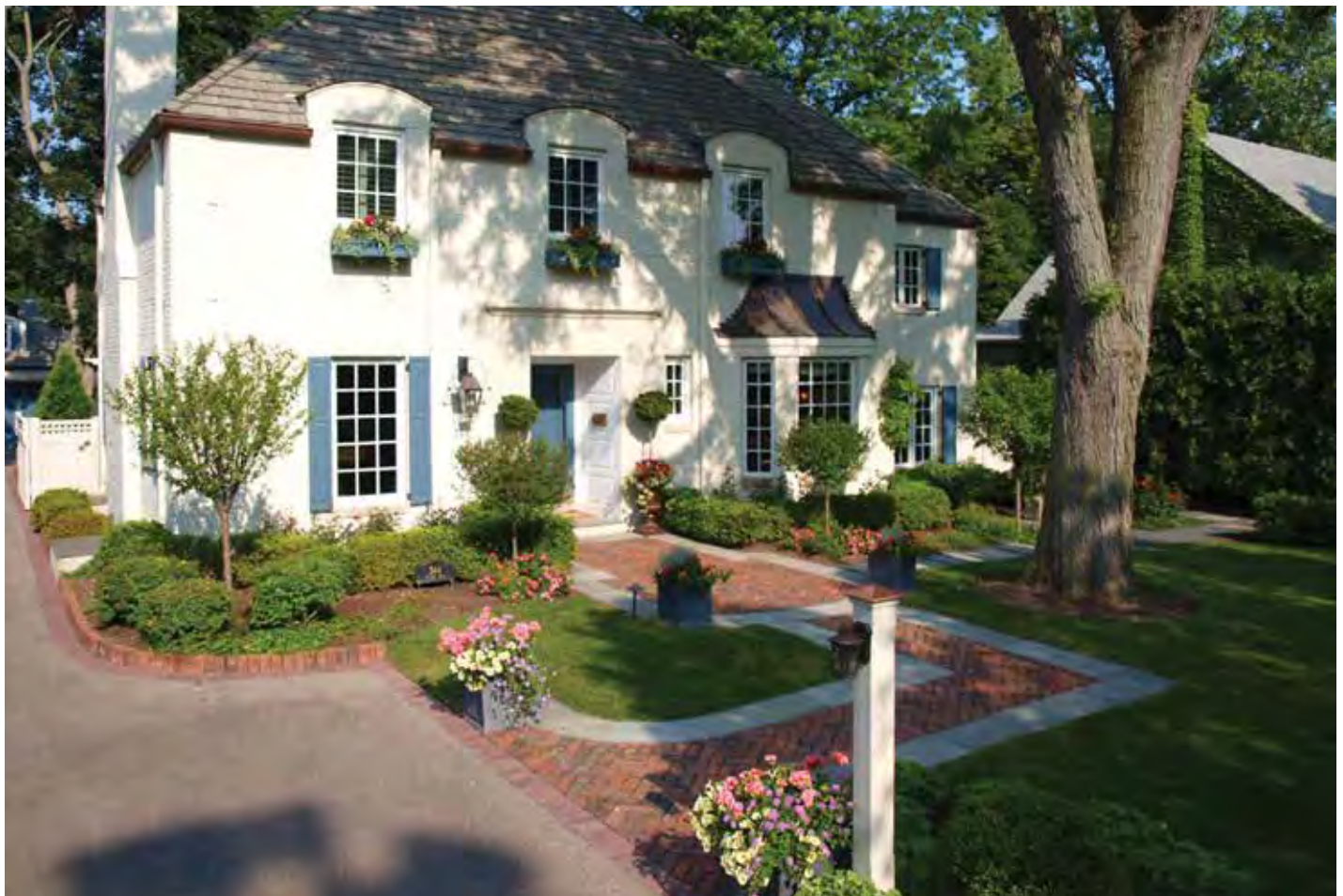
Getting your home and yard ready for spring requires some basic landscaping and a few general maintenance tasks.