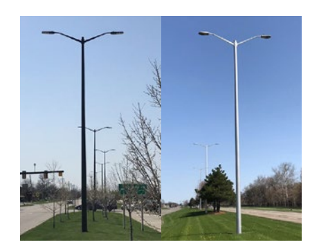
DTE Post Code 71/73 & 81/83 : 30' or 40' black or silver dual arm fiberglass direct bury post with breakaway base.