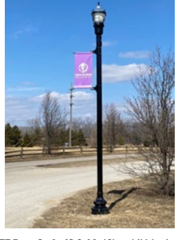
DTE Post Code 12 & 14 : 12' or 14' black aluminum post. Direct bury or concrete foundation options available. Engineered to support banner arms and receptacles.