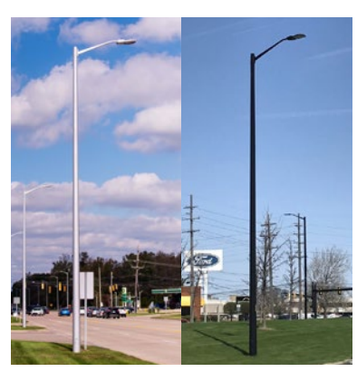
DTE Post Code 70/72 & 80/82 : 30' or 40' black or silver single arm fiberglass direct bury post with breakaway base.