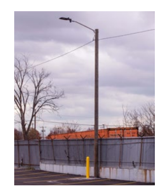
These lights can also be mounted on a wood utility pole.