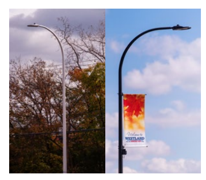
DTE Post Code 06 : 28.75' black or silver single davit arm steel post mounted to concrete foundation-engineered to allow receptacles. Breakaway base option for this post design.